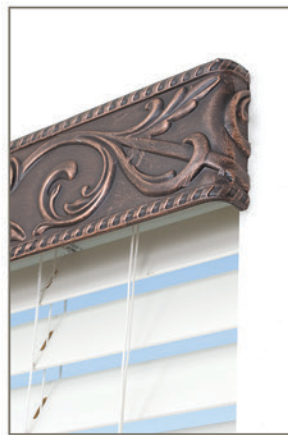
Inside Mount Plus Frame