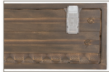
Tall (Two Wood Slats)