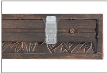
Medium (One Wood Slat)