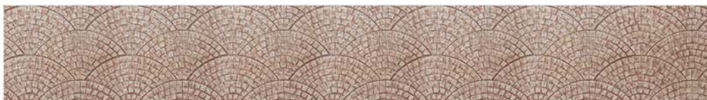
CC8079 MOSAICS H 6" VERSACE