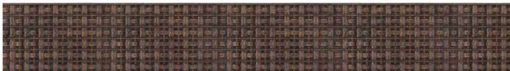
CC8077 LATTICE WEAVE H 6 1/8" BRONZE VECCHIO