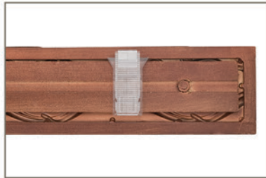
Narrow (One Wood Slat)