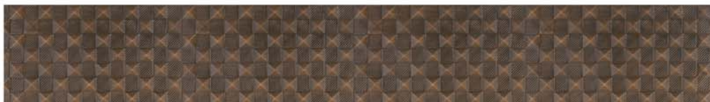
CC8075 PYRAMIDS H 6" VECCHIO PATINA